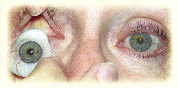
Gently slide the top of the prosthesis under the upper lid.

Hold the prosthesis between your thumb and middle finger. Lift the upper lid with your other hand.